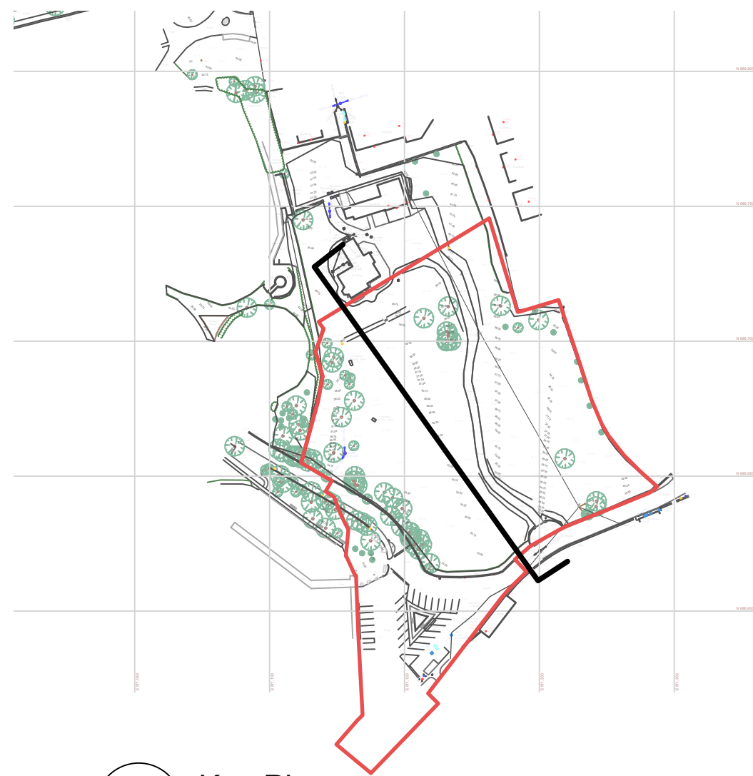
3 Key Plan Scale: 1:2000